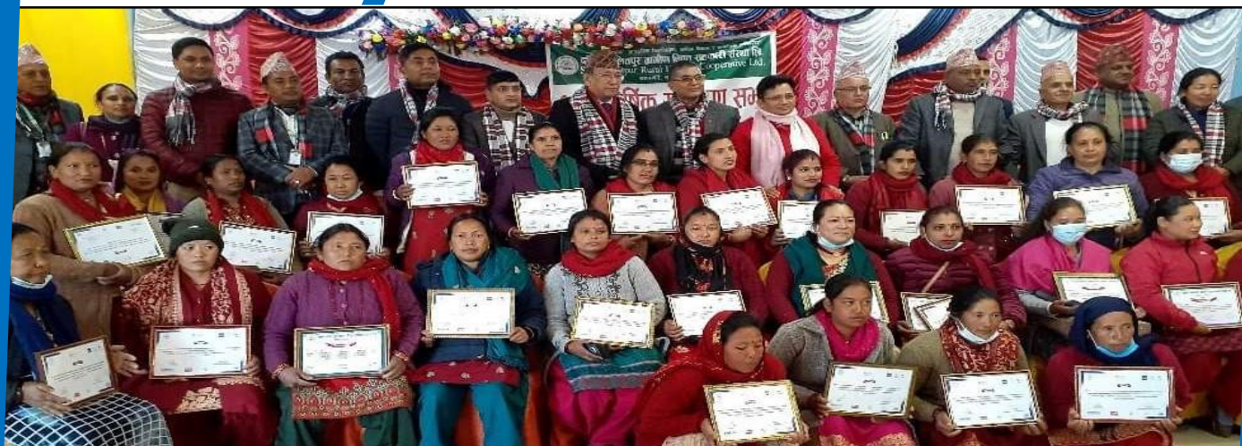
Women Entrepreneurs after Receiving Certificates and Award with Honorable Minister Ms. Pampha Bhusal