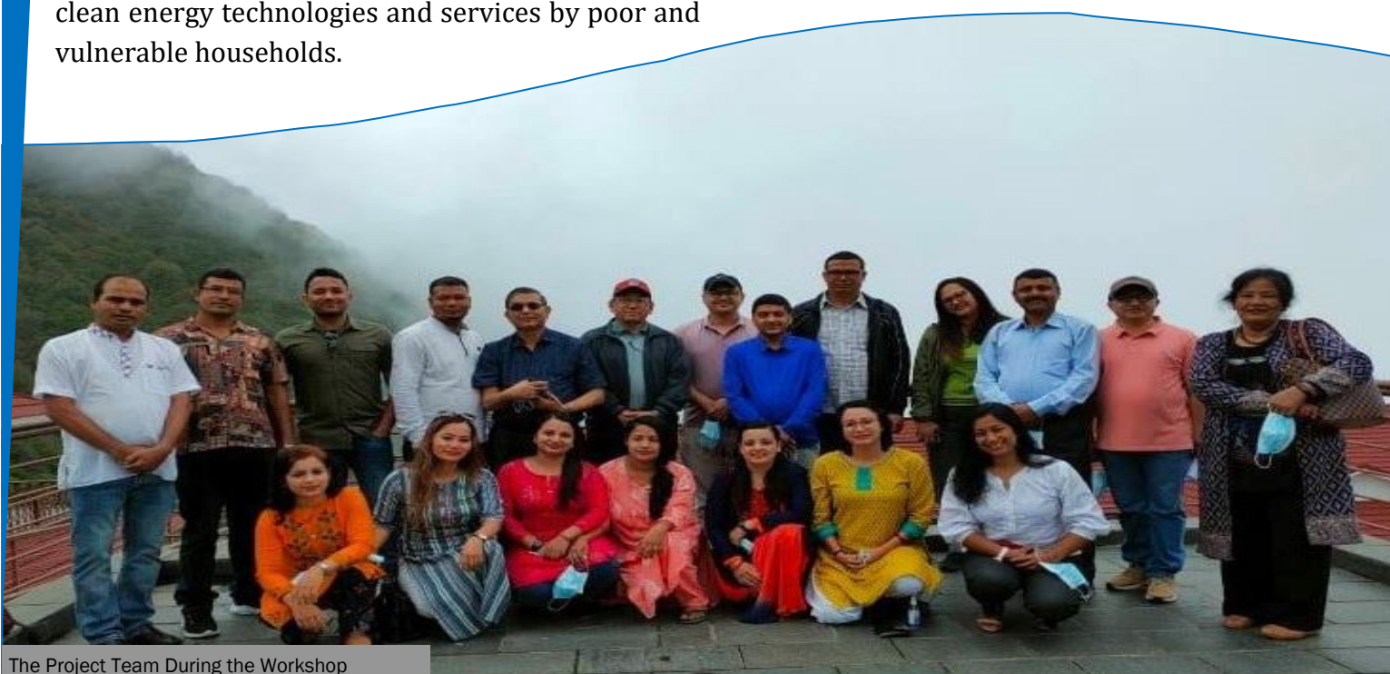
The Project Team During the Workshop

The major activities and target under the output includes livelihood skills training need assessment for poor women of at least 15 EUCs from seven districts; business orientation training targeting 500 women; training of 500 EUC women members from poor and marginalized groups in energy-based livelihoods and related technical skills; and post-training support for linkage to accessing finance and market for such enterprises.