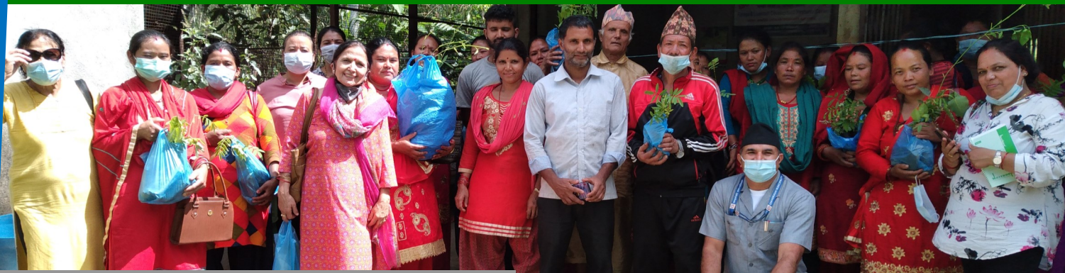
Participants After the Exposer Visit to Galchi to Observe Grass Nursery

As per the MoU with CSD, CRT/N jointly with Mahila Sahayogi Saving and Credit Cooperative has been implementing Self-help Eco-Village Development in Masine-2, Chandradagiri Municipality, Kathmandu of Bagmati Province since September 2021. Under this project Goat Farming training was organized between 29-30 September 2021 at Shree Champa Shikhar Secondary School, Chandragiri-2 Masine village. The objective of the training was to orient the cooperative's members on goat farming and encourage them towards the commercial goat farming to enhance their livelihood.