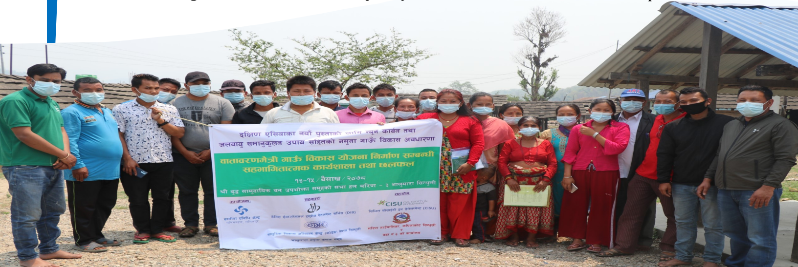
Participants along with the Facilitators

Rural Appraisal (PRA) approach with slight modification to the eco-village context was used to facilitate the training cum workshop. The PRA approach were used to identify the existing demographic scenario, problems relevant to energy, environment and energy sector, potential solutions, opportunities and challenges within the village. The finding obtained from this training along with the baseline survey will be used to develop eco-village plan for the community inhabiting Bhalumara-3, Marin Municipality, Sindhuli. Besides this, the participants were also familiarized about the climate change and its related problems through videos presentation. In addition to this renewable energy technologies and its benefits were also discuss and presented.