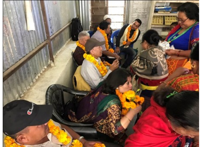
Welcoming Gesture from Dharpa-3 Community