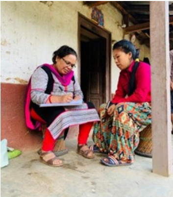
Interacting with Respondent in Field