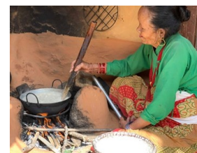
Respondent using TCS

it is safe to drink directly from the tap and 98% respondents answered there