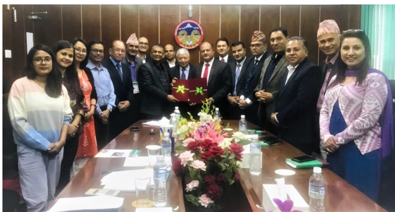
Group Picture of Participants in the MoU Signing Ceremony

Centre for Rural Technology, Nepal (CRT/N), National Association of Community Electricity Users Nepal (NACEUN) and Agricultural Development Bank Ltd. (ADBL) has signed Tripartite MoU to work in joint collaboration to provide access to finance for enterprise development of Women Entrepreneurs trained under Output 2 "TA 9334-NEP: Strengthening the Capacity of the Energy Sector to Deliver Gender Equality and Social Inclusion Result and Empowering Women Engendering Energy – Nepal" project. This project has been