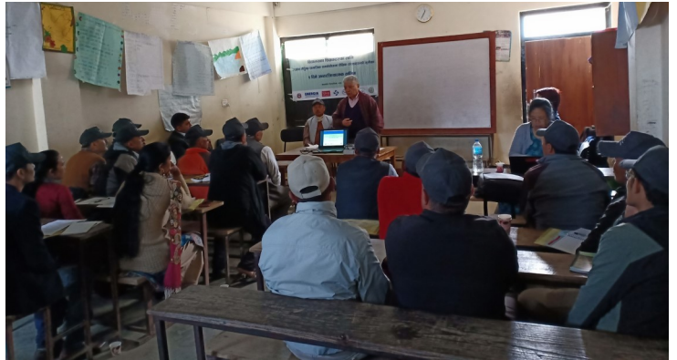
First day of ToT at Opening Sessions

training every school developed implementation plan to create a green, clean and healthy school environment, which was aligned with Rural Municipality's Policy & Strategies Paper, 2076.