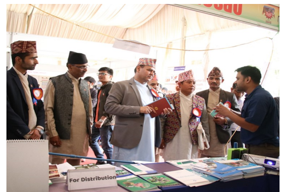
Visitors in the Exhibition

Pump were also displayed during the exhibition which were the major attraction of the stall. Vice President the Rt. Hon'ble Mr. Nanda Bahadur Pun addressed the ceremony and also visited the stall. Other visitors were from Government Agencies, Non-Government Organizations and Community-Based Organizations and various other visitors visited the exhibition.