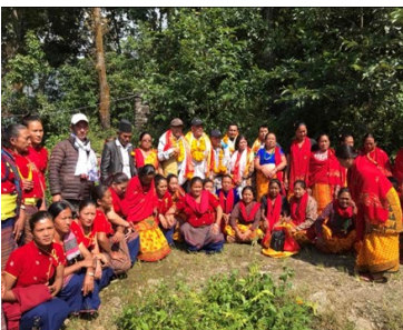
Participants of Interaction Meeting

After nearly 5 years of experience in developing approach and strategies to promote EVD concept in rural Nepal, CRT/N has formed an official consortium with Center for Self-help Development (CSD) and Manushi Laghubitta Bittiya Sanstha (Manushi Micro-Finance Institution) to develop “Model