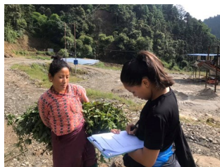
Student Conducting Survey

GEWNet conducted two student researches with the objective to provide practical exposure for students and identify GEWNet as a knowledge hub itself. Two students from Naya Aayam Multi-disciplinary Institute (NAMI) College carried out the study in Chyasingkharka -05, Bethanchok the Rural Municipality (RM) of Kavre district listed under province 3 of Nepal.