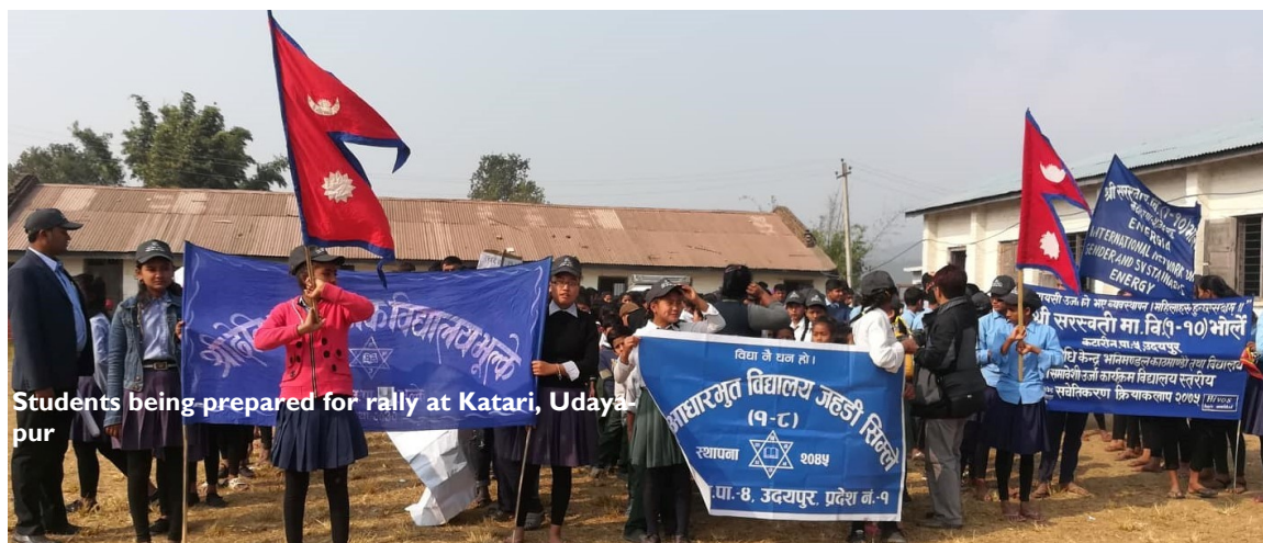
Students being prepared for rally at Katari, Udayapur

Similarly, GIE conducted alike programme at Chandrakot, Gulmi district. In Gulmi, the event was organized at Udaya Secondary School where other schools: Chandrakot Secondary School, Gyan Udaye Secondary School, Chakreswor Secondary School and Sharada Secondary School took part in the competition.