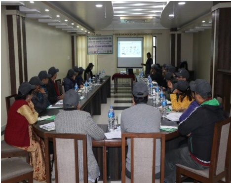
Participants in sensitization programme in Butwal

GIE Nepal has organized province level programme on December 23, 2018 in Butwal to undertake a facilitative role to bring inclusive renewable energy and productive use of energy in the forefront of the provincial government. The objective of programme was to support in development of energy sector with scoping multi pro-