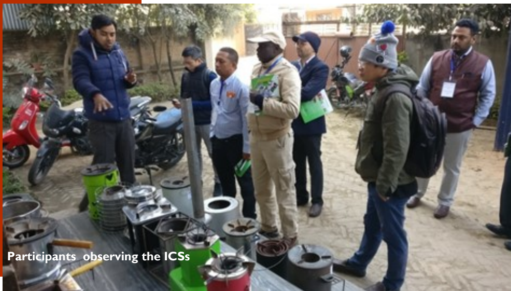
Participants observing the ICSs

about the new ISO testing protocol and had practice test on rocket stove, forced draft stove and chimney stove. Participants also learnt about the leak check test of LEMS system, which is one of the essential processes for quality assurance in new ISO protocol.