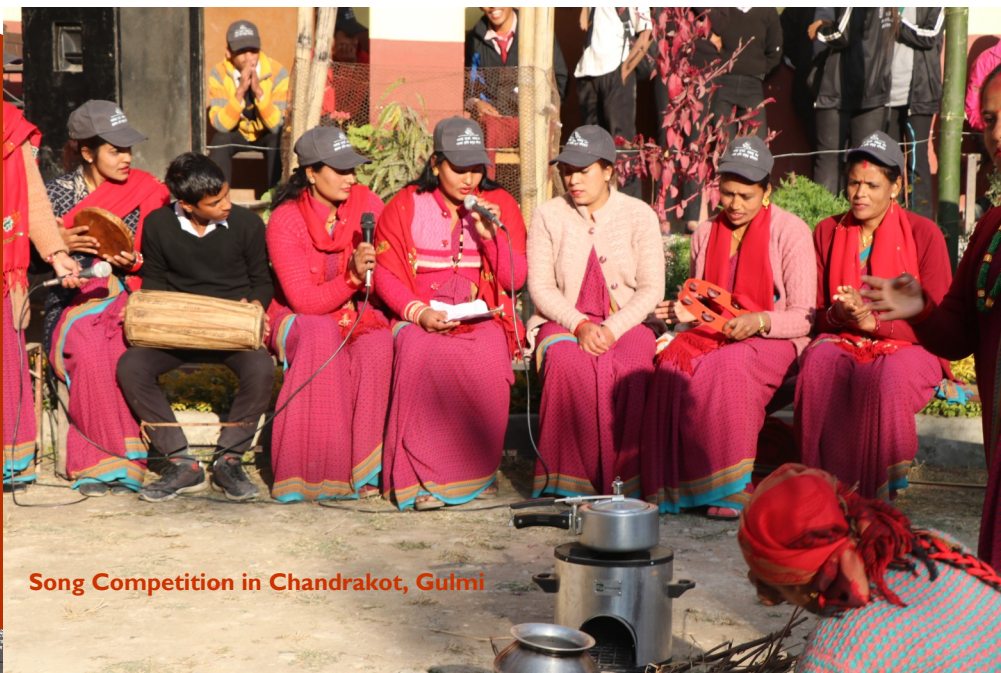
Song Competition in Chandrakot, Gulmi

The objective of the event was to create awareness on gender & inclusive energy , easy access for domestic and productive uses, demonstration of Improved Cookstove and sharing information in the mass. The woman groups were given monetary prize as an encouragement.