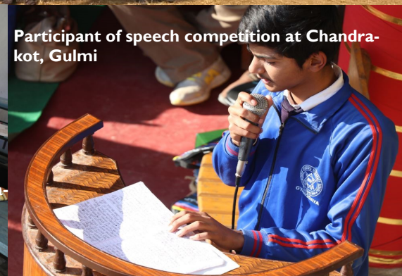
Participant of speech competition at Chandrakot, Gulmi