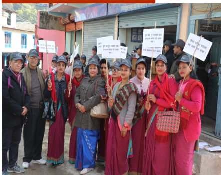
Participants of rally in Chandrakot, Gulmi

GIE Programme Nepal supported rally programme organized by Santipur Community Rural Electrification Entity, Chandrakot in Gulmi district on December 20, 2018. Mothers group, MFIs, cooperatives representatives and other like minded people participated in the rally. The rally was started from the office of Santipur Community Rural Electrification Entity and