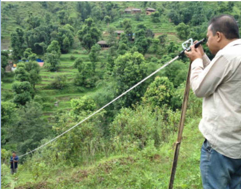
Survey for penstock pipe route of pico hydro

The Detailed Feasibility Study (DFS) of the two sites of Udaypur district was conducted by hiring APEC's pre qualified surveying consultant. The DFS was conducted following the standards and guidelines of AEPC using Medium Irrigation Project (MIP) software. The DFS comprises technical details like head, discharge of water, power output, design and drawings, costing of project, tariff structure, etc.