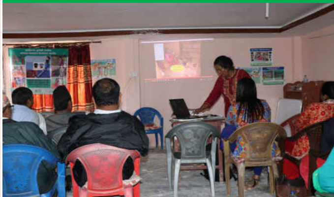
Presentation on Gender & Social inclusion in energy uses