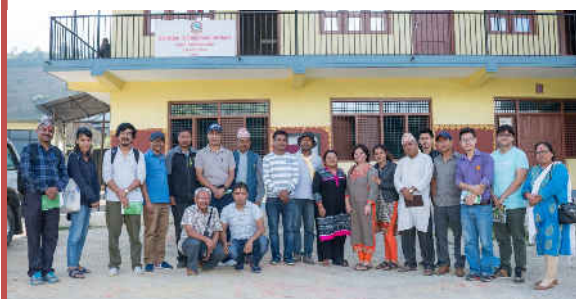
Members of various CSOs visiting EVD Site