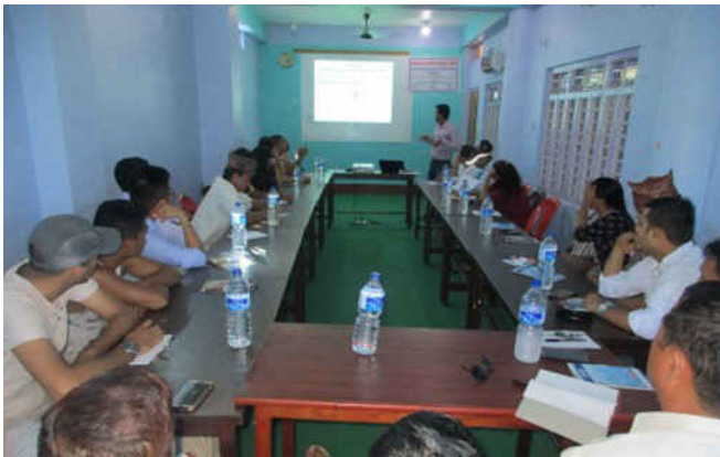
Project introduction workshop being held at Gaighat, Udayapur

“Improving Rural Livelihoods in Nepal with Pico-Hydro Electrification and Improved Water Mill” is a one year programme which started from July 2018 and will end in September 2019. The programme is supported by Siemenpuu Foundation, Finland. It will be implemented in two different rural municipalities: Nachne Village of Rautamai Rural Municipality and Himma Village of Linchungbuu Rural Municipality of Udaypur District where two units of Pico-Hydro and improved water mill system one in each village will be installed to provide the benefits to the community and improve their livelihood.