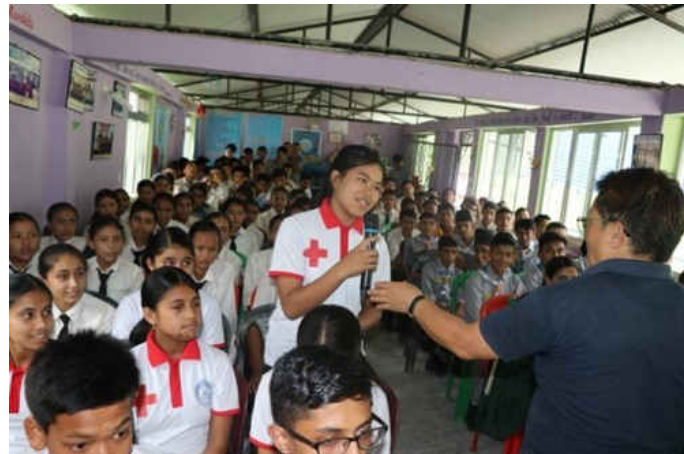
Sensitization Programme at Shree Chakreswar Secondary