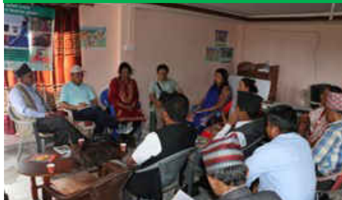
Consultation meeting with CREEs, Cooperatives/MFIs Rainadevi Chhahara Rural Municipality