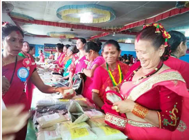
Women ready in the festival dress ; buying from the stall

An event “Woman Entrepreneurs Festival” dedicated to supporting woman entrepreneurs was celebrated for the first time in the Sindhuli district. The event was celebrated for two whole days and was organized on the occasion of festival Teej. The festival aimed to promote woman entrepreneurs, give them the exposure and support to marketize their various products.