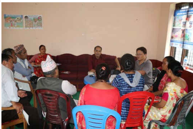
Interaction meeting with Chandrakot Rural Municipality

The objectives of these activities were to share the needs, challenges and opportunities in the RE sector, conduct campaign for clean energy and healthy homes and sensitize local representatives to understand the importance of RE and support them to integrate RE in their development plans. The sensitization programmes focused was to highlight the present status of energy for cooking lighting and other productive uses of Rural Municipality, future planning of Rural Municipality in promotion of RE/RETs, multiple uses of energy for economic and woman empowerment, discussion on present policy, scope and issues to lend credit facilities in RE sectors, possible way forward to provide credit facilities in energy or energy based business .