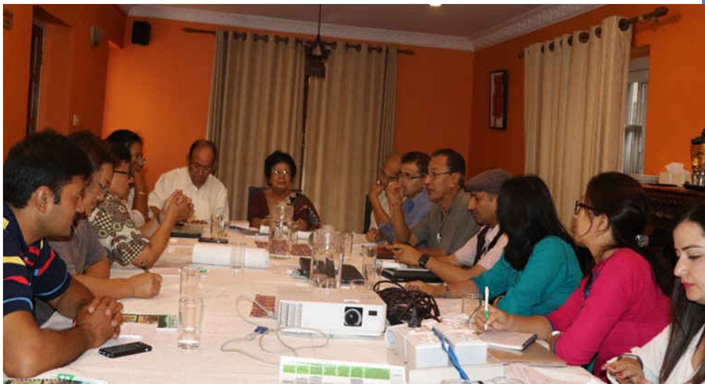
Meeting with the advisory members

In Nepal, CRT/N is working as a lead organization with policy support from the Alternative Energy Promotion Centre (AEP) and in partnership with Indoor Air Pollution and Health Forum (IAPHF), Nepal Forum of Environmental Journalists (NEFEJ), Renewable Energy Confederation of Nepal (RECoN) and National Association of Community Electricity Users Nepal (NACEUN). On August 23, 2018, this network conducted meeting with the Advisory Group members with the objectives to provide introduction about GEWNet; share information on GIE programme and interact on activities identified by GEWNet under GIE programme. The programme provided the platform for all the members to provide comments/inputs on the network activities and direction for further action.