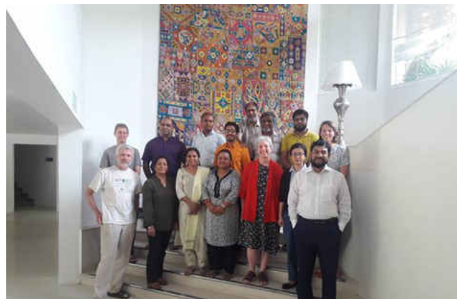
Participants in Sri Lanka