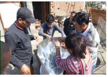
RTKC team undertaking first Solar test

With the equipment support of Solar Cooker International (SCI), RTKC Nepal has now acquired solar cooker testing station for performance evaluation process (PEP) for solar cookers. With PEP test station, RTKC Nepal can test different types of solar cookers: panel, box, parabolic, etc.