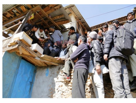
Participants during Practical Session

Centre for Rural Technology, Nepal (CRT/N) conducted five days training on ing under EVD proiect from January 2-6, 2018 in